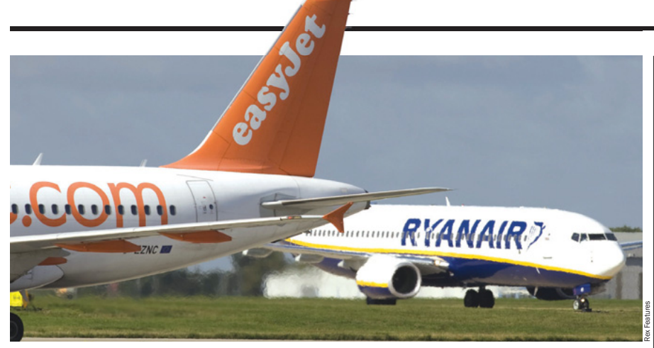
EasyJet and Ryanair have very different policies towards contracting their flightcrew

>>>> normally notified well in advance, so there is at least a degree of predictability about the contract pilots' working lives. IFALPA claims that in reality, life for some pilots entails rather more sudden requirements to move, which the Brookfield contract permits.